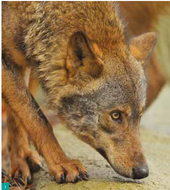
1. IBERIAN WOLF

At the foot of the Grand Rocher, in the shadow of the mighty evergreens, spy the animals living at the heart of Europe's forests: otters, cinereous vultures, the northern bald ibis, wolves, lynx, and wolverine. Within the vivarium, river, garrigue, and mountain habitats are populated by frogs, newts, toads, turtles, lizards, and snakes.