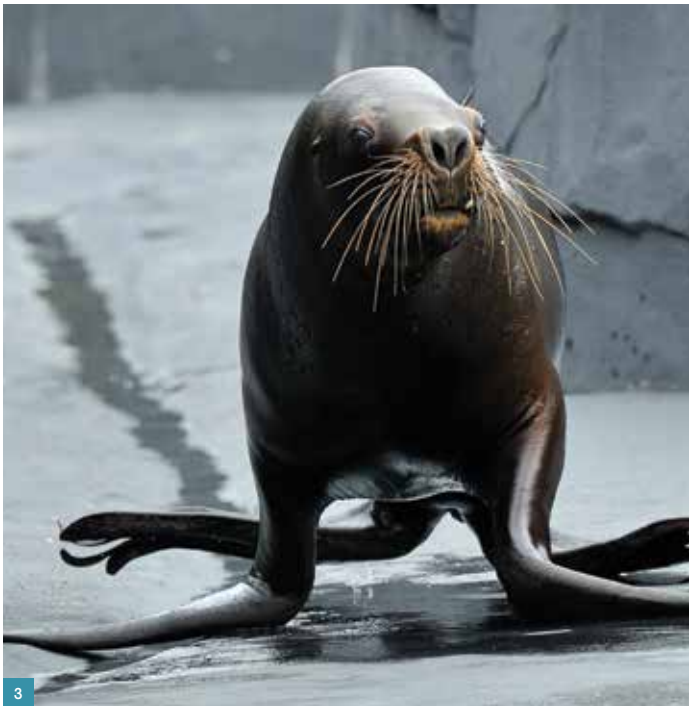
3. SOUTH AMERICAN SEA LION