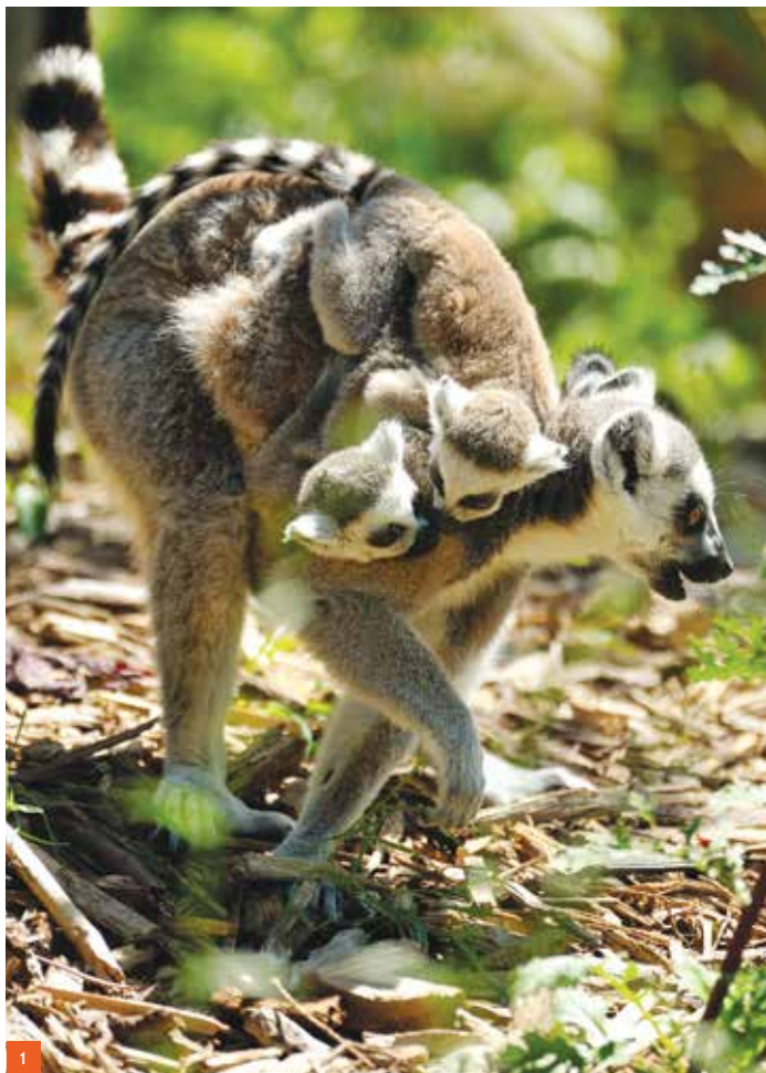
1. RING-TAILED LEMUR